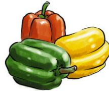
Plate "Sonne" (Sonnenteller)

Fried potato corners with broccotilie and cheese au gratin